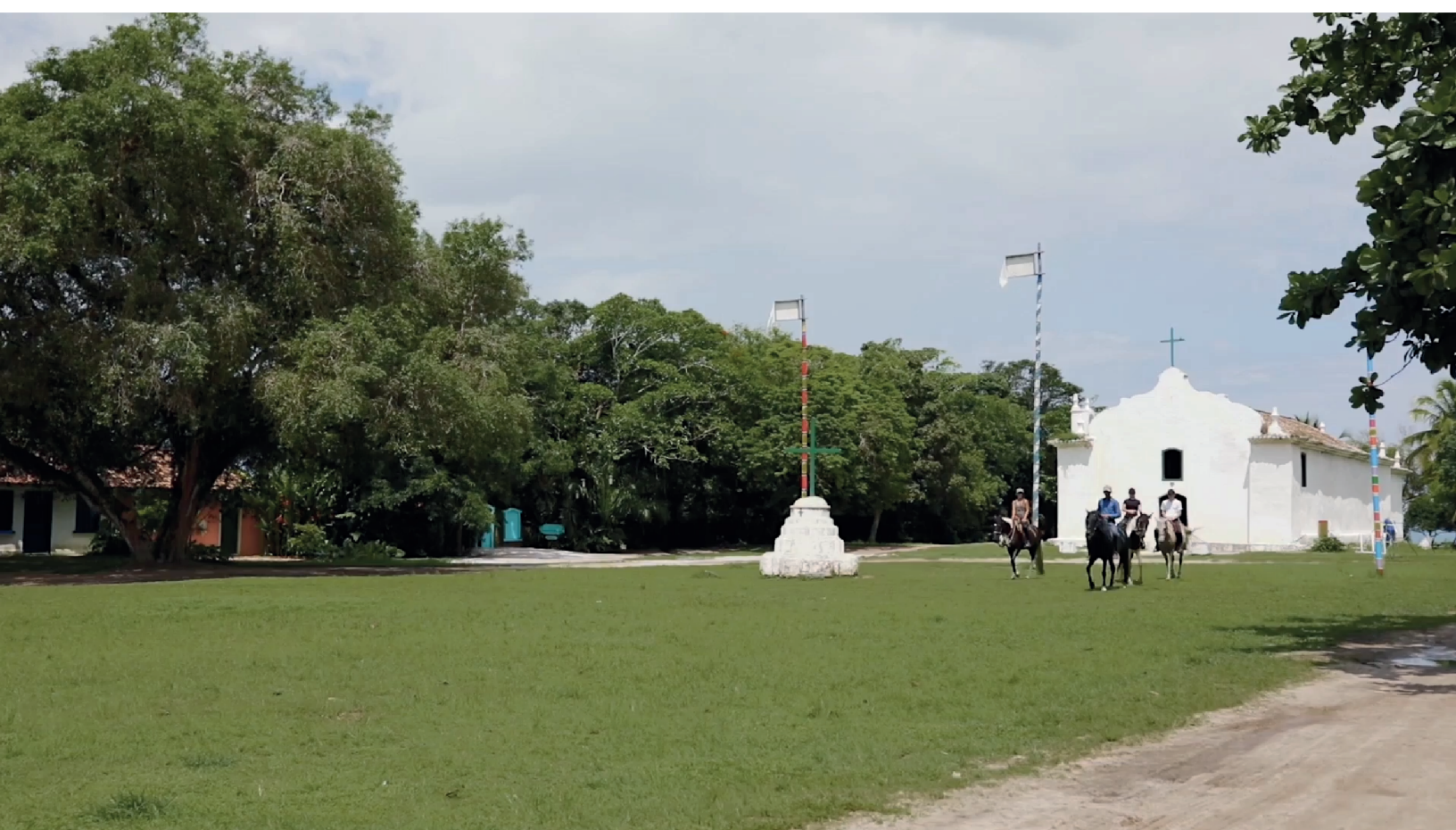
Horseback riders in Trancoso's Unesco-protected quadrado central . VIDEO BY MARTA TUCCI FOR BLOOMBERG BUSINESSWEEK

With that in mind, we put together a list of 21 places that can fulfill whatever you want most in a vacation, whether it's outdoor adventure, luxurious pampering, delicious food, decadent nightlife or simply, a little peace and quiet. And to help you maximize your time off, we gathered insights from destination experts on the most ideal (and questionable) times to travel; paired with custom hotel price data from Google, finding your perfect trip is easier than ever.